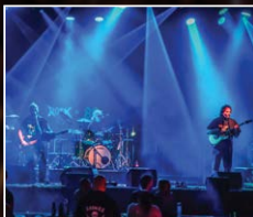
ROCK OF 80S DUO SUNDAY, AUG 4