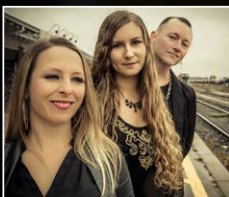
THORN AND ROSES SATURDAY, AUG 3