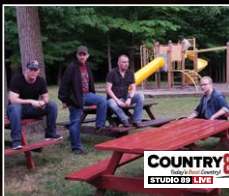
WHISKEY SUNSET SUNDAY, AUG 4