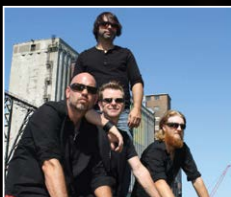
HARD ROCK HOOLIGANS FRIDAY, AUG 2