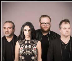
BLUSH SATURDAY, AUG 3