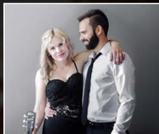
TIN ROOF SATURDAY, AUG 3