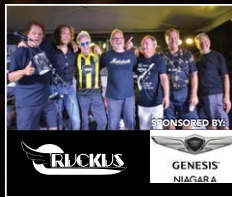
RUCKUS SUNDAY, AUG 4