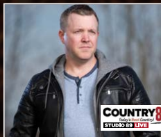
BRAD BATTLE SUNDAY, AUG 4