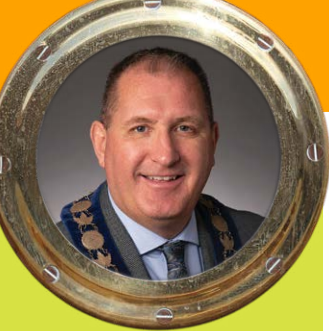
BILL STEELE MAYOR