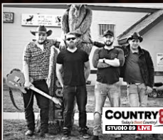
DAYLIGHT BURNERS SUNDAY, AUG 4